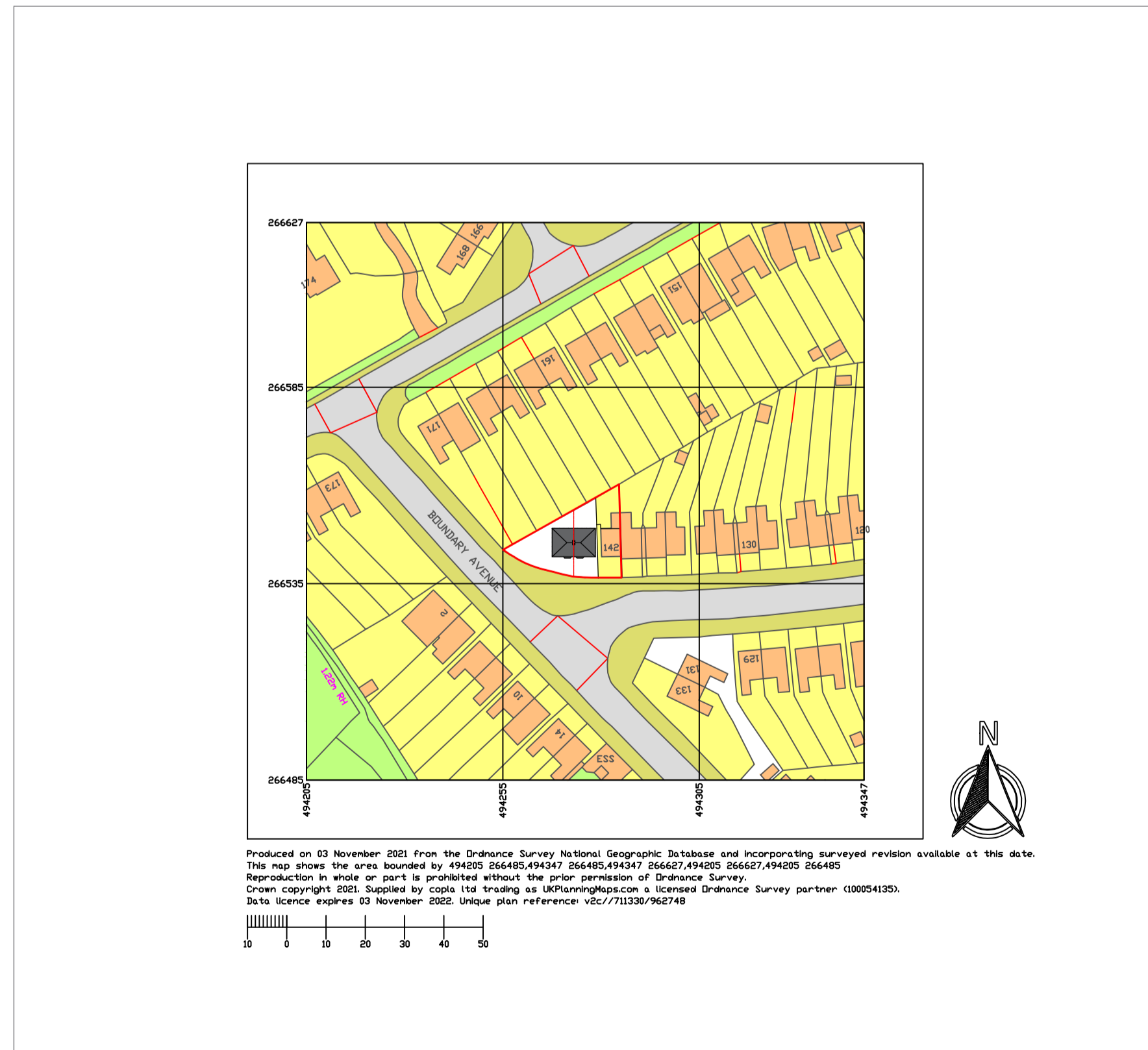
Proposed Site Location Plan Scale 1:1250